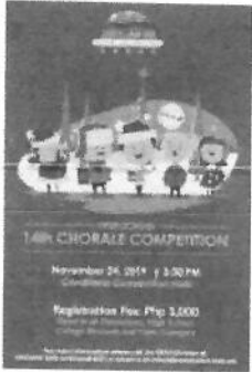
14th Chorale Competition v2.jpg 2989K

The Baguio Country Club is not liable for the proper and complete transmission of the information contained in this email nor for any delay in its receipt. The use of email for any unlawful purpose or for any purpose other than as permitted by BCC is strictly prohibited. Opinions, conclusions, and statements in this email are opinions, conclusions, and statements of the sender and are not necessarily given, endorsed, espoused or expressed by BCC.