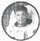
Steven Swanson Former Astronaut & ISS Commander, National Aeronautics and Space Administration