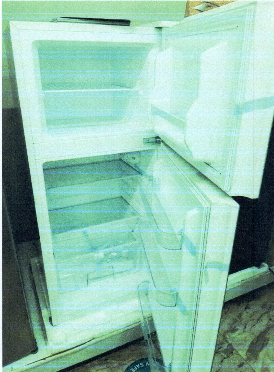
Item 6. Refrigerator, two-door