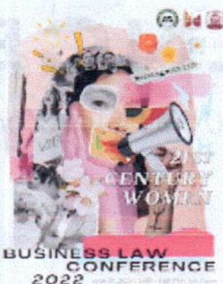
BLC - MAIN POSTER.png 4423K

The information contained in this e-mail, including those in its attachments, is confidential and intended only for the person(s) or entity(ies) to which it is addressed. If you are not an intended recipient, you must not read, copy, store, disclose, distribute this message, or act in reliance upon the information contained in it. If you received this e-mail in error, please contact the sender and delete the material from any computer or system. Any views expressed in this message are those of the individual sender and may not necessarily reflect the views of De La Salle University.