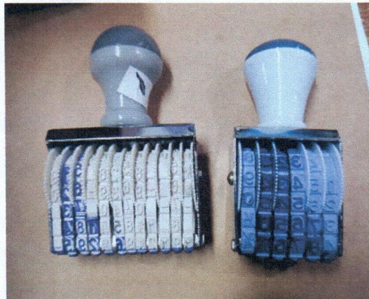
12-digit rubber stamp 6-digit rubber stamp