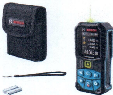
Bosch GLM 50-27 CG