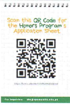
Honors Program - QR Code.png 1360K

The views seen in this message are of the individual sender and may not necessarily reflect the views of St. Paul University Manila. The official views of the University are posted in its website.